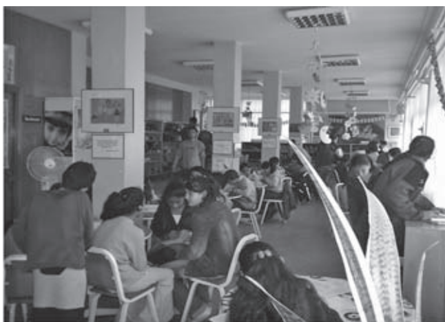
III. 1: Adults hall in Izmir Atatürk Public Library

Since 1960, all public libraries are administered by the Ministry of Culture and Tourism, General Directorate of Libraries and Publishes in Turkey, where the population is around 71 million with 81 provinces in seven large geographic regions. The General Directorate of Libraries is the largest department within the Ministry in terms of its budget and personnel. The children libraries, which are operated under the Ministry of Culture and Tourism, are mainly established in the public libraries. Some children libraries have their own building, although there has been a recent trend towards having children libraries within the public libraries. There are also a few municipal libraries governed and financed by the local authorities. There are several articles in the regulations of the municipalities regarding the establishment of public libraries.