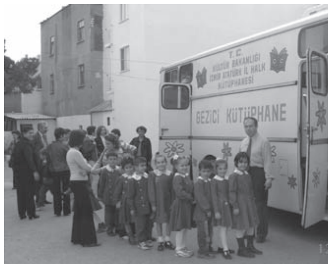
III. 2: Mobile library of Izmir Atatürk Public Library

Public libraries are largely financed by the central government. However, the municipal administration provides some financial aid to the public libraries. Most of the local authorities support the Ministry of Culture and Tourism by providing the library buildings. The organizational structure of the libraries in the cities is as follows: