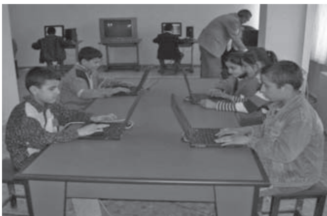
III. 1: Van Province Public Library

For Van Province Public Library the aim is to be one of the best local information centres and give the best user focused service continuously. In 2007, 20 000 of 27 000 materials were lent for reading and finding information. In context with public connections, in Van streets, it is possible to see bags in hands of people on which our library name is written and, also, possible to see book marks among reading people. Computer and internet technologies go forward rapidly as an unseparable part of our life. Those who can get information power, can also get stock human power.