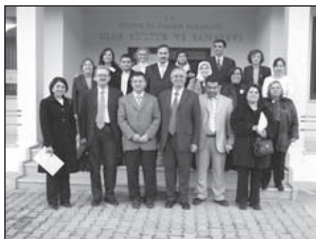
III. 3: A group of visitors for a seminar in Ulus Public Library