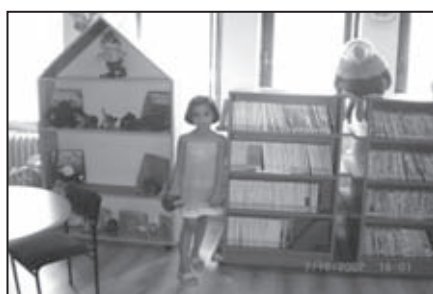
III. 1: A view from children library in Ulus Public Library

In addition to the periodical publications subscribed to by the ministry, daily newspapers and periodical publications devoted to public interest (food, sports, computer, knitting, etc) are bought by our library with the local funding and the periodical publications department becomes more attractive. Similarly, CDs and DVDs are bought on a wide range of subjects (family, health, documentary films, music, films, cartoons, etc) to lend to our members.