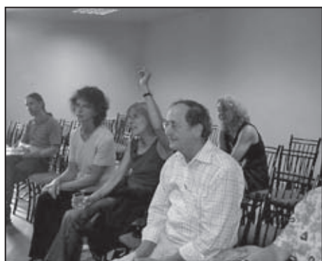
III. 4: A Conference in Ulus Public Library