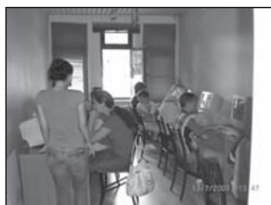
III. 2: Internet cafe in Ulus Public Library

The first Internet Public Connection Centre was established by our library in Turkish library system. Together with this service which maintains 15 computers, for the county a computer usage course was first opened by our library (and if they wish members may have personal cupboards).